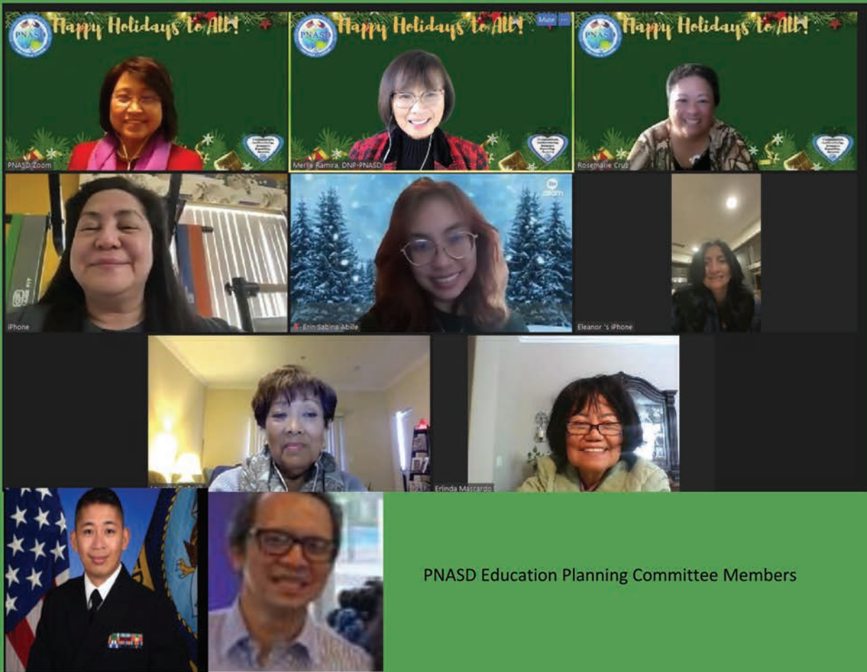
PNASD Education Planning Committee Members